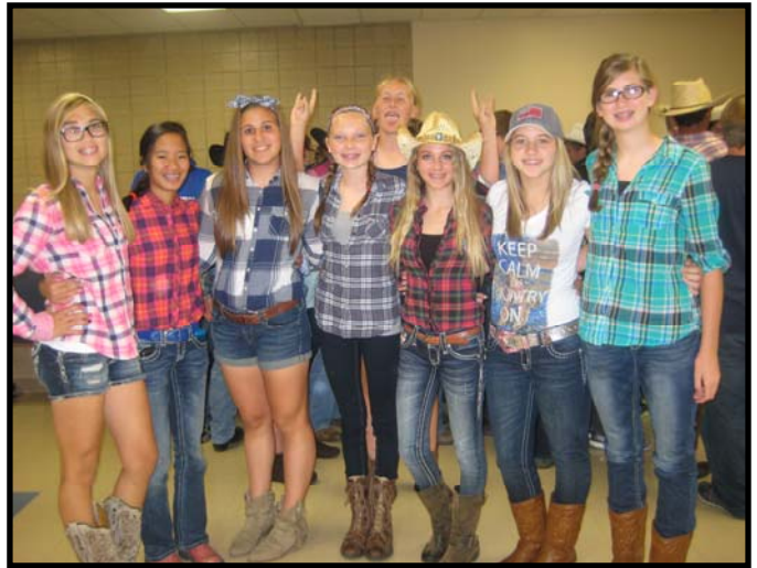
Garretson freshmen cowgirl up for Western Day

Some of the days in the past were truly missed. Many people wished to see Character Day come back and possible Nerd